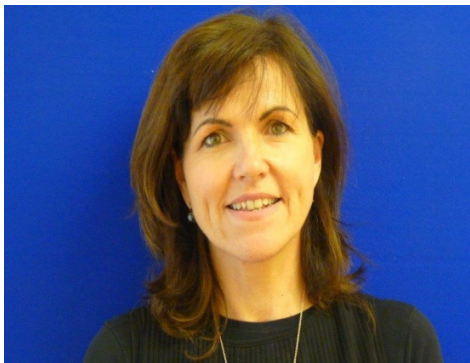
Designated Liaison Person (DLP)